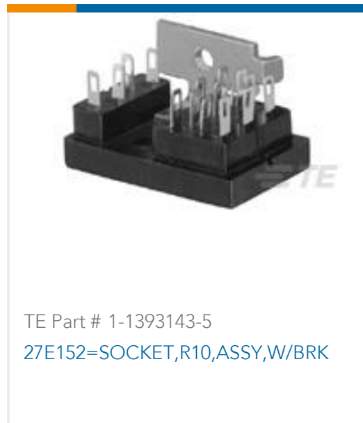
TE Part # 1-1393143-5 27E152=SOCKET,R10,ASSY,W/BRK