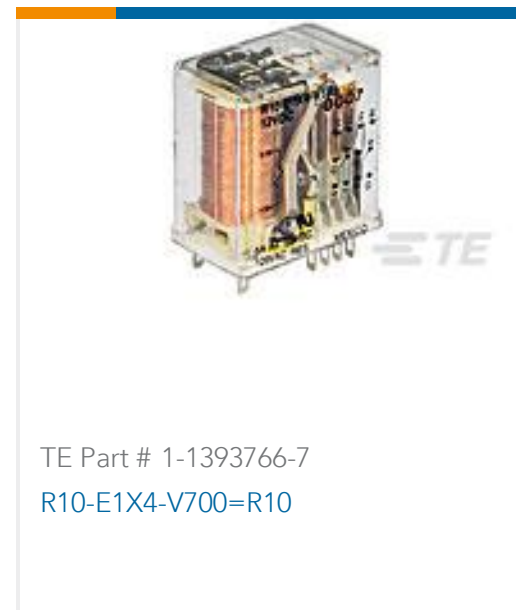
TE Part # 1-1393766-7 R10-E1X4-V700=R10