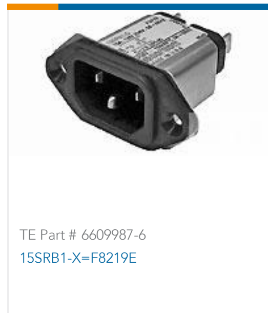
TE Part # 6609987-6 15SRB1-X=F8219E