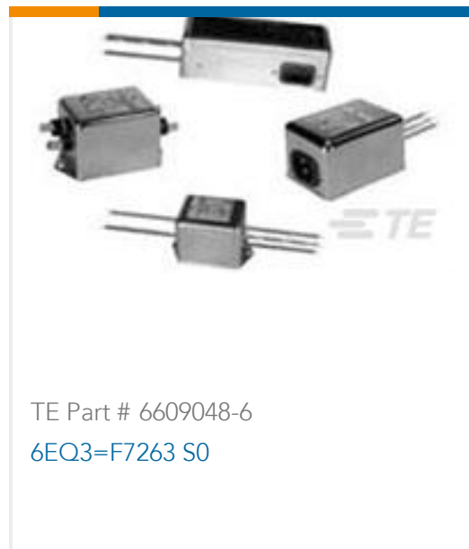
TE Part # 6609048-6 6EQ3=F7263 S0