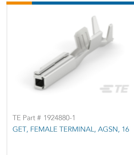
TE Part # 1924880-1 GET, FEMALE TERMINAL, AGSN, 16