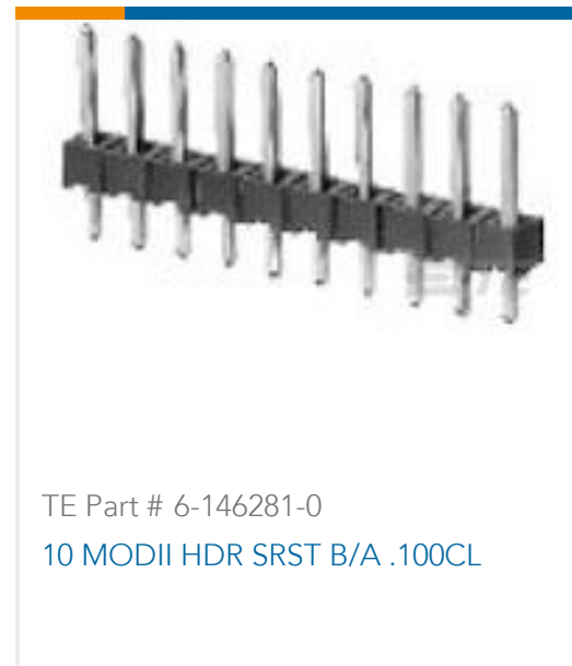
TE Part # 6-146281-0 10 MODII HDR SRST B/A .100CL