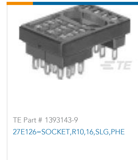
TE Part # 1393143-9 27E126=SOCKET,R10,16,SLG,PHE