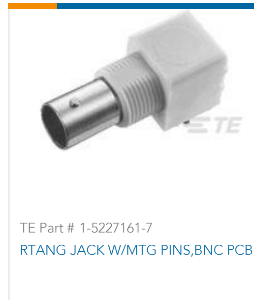
TE Part # 1-5227161-7 RTANG JACK W/MTG PINS,BNC PCB