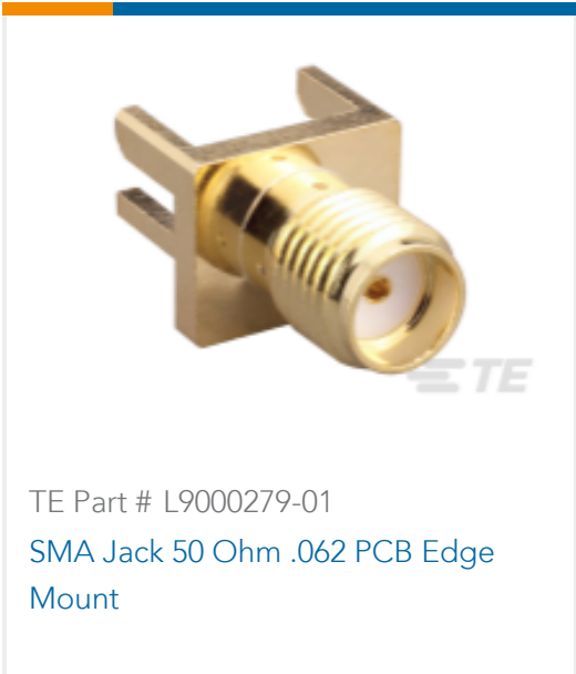
TE Part # L9000279-01 SMA Jack 50 Ohm .062 PCB Edge Mount