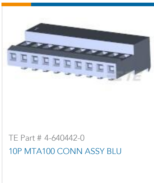
TE Part # 4-640442-0 10P MTA100 CONN ASSY BLU