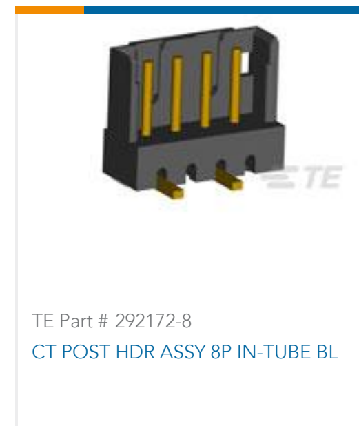
TE Part # 292172-8 CT POST HDR ASSY 8P IN-TUBE BL