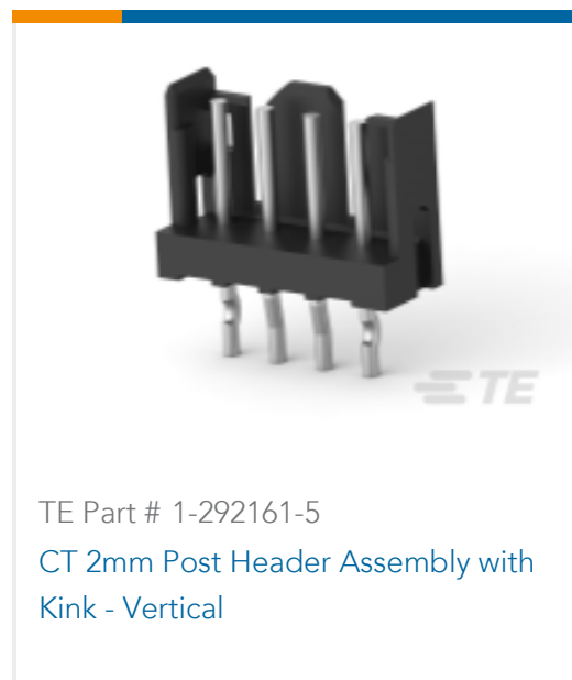
TE Part # 1-292161-5 CT 2mm Post Header Assembly with Kink - Vertical