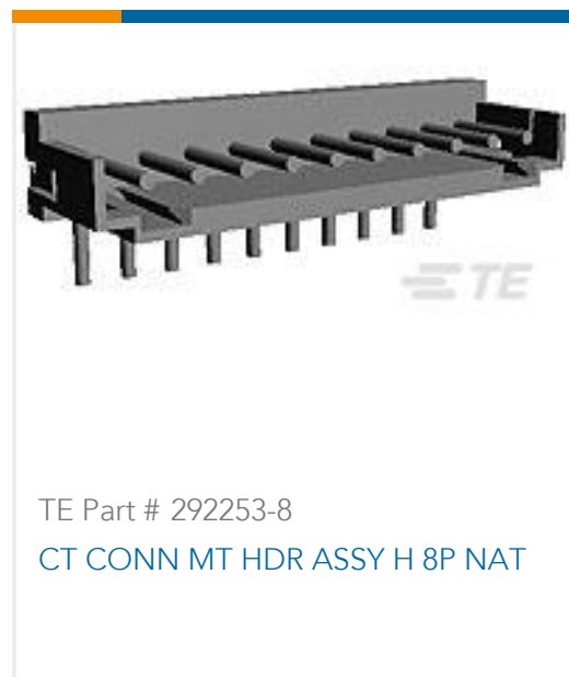
TE Part # 292253-8 CT CONN MT HDR ASSY H 8P NAT