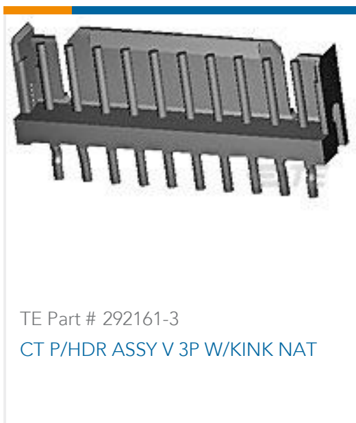
TE Part # 292161-3 CT P/HDR ASSY V 3P W/KINK NAT