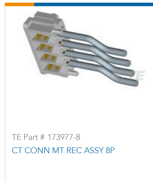
TE Part # 173977-8 CT CONN MT REC ASSY 8P