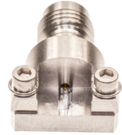
Standard Profile ELF50-002