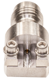
Narrow Profile ELF50-001