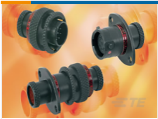
TE Part #ASDD010-23SA RECEPT 2 HOLE MTG ASSY 10-23 AS DOUBLE D