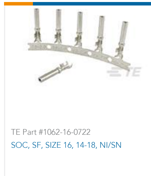
TE Part #1062-16-0722 SOC, SF, SIZE 16, 14-18, NI/SN