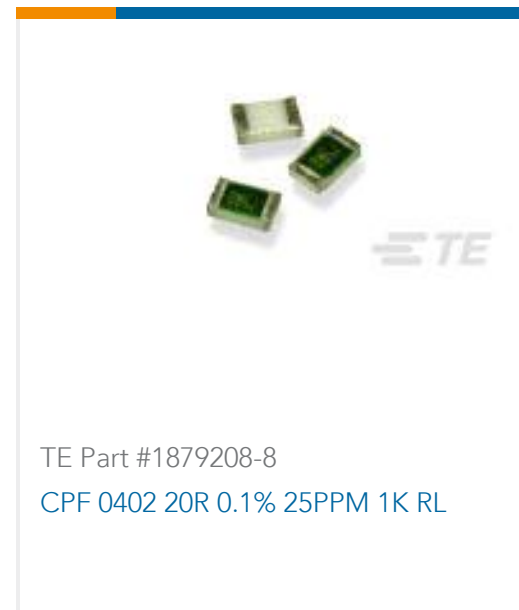
TE Part #1879208-8 CPF 0402 20R 0.1% 25PPM 1K RL