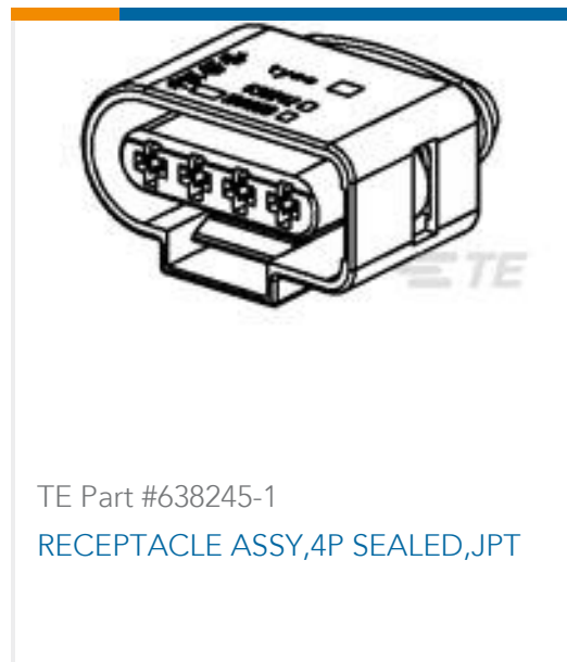
TE Part #638245-1 RECEPTACLE ASSY, 4P SEALED, JPT