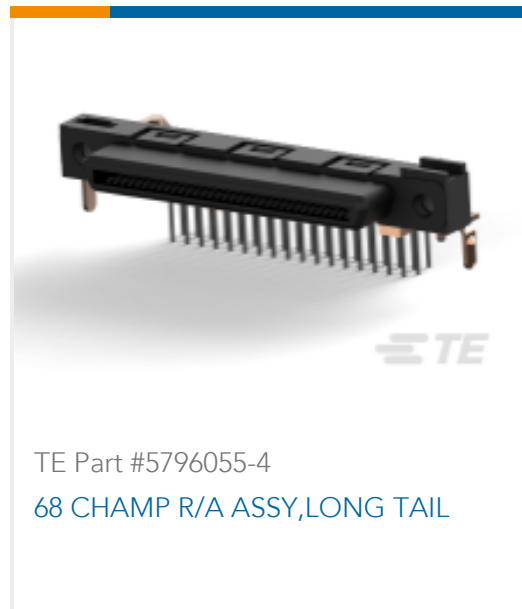
TE Part #5796055-4 68 CHAMP R/A ASSY, LONG TAIL