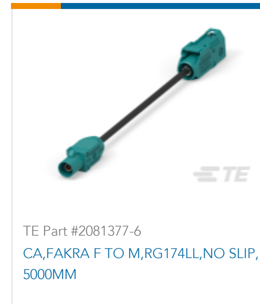
TE Part #2081377-6 CA, FAKRA F TO M, RG174LL, NO SLIP, 5000MM