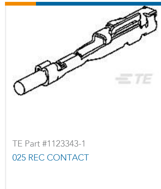
TE Part #1123343-1 025 REC CONTACT