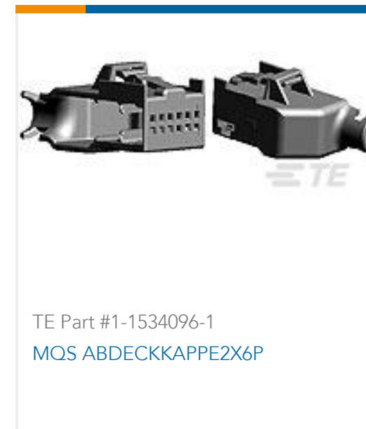
TE Part #1-1534096-1 MQS ABDECKKAPPE 2X6P