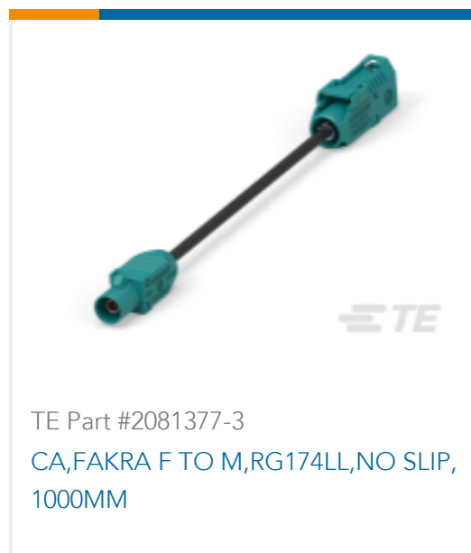
TE Part #2081377-3 CA, FAKRA F TO M, RG174LL, NO SLIP, 1000MM