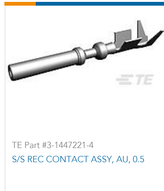
TE Part #3-1447221-4 S/S REC CONTACT ASSY, AU, 0.5