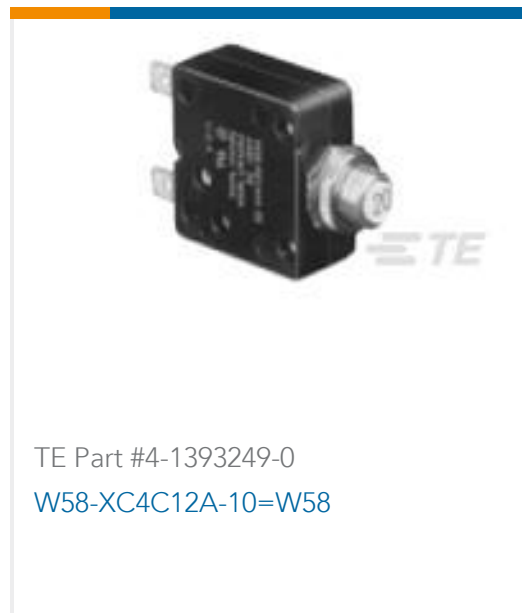
TE Part #4-1393249-0 W58-XC4C12A-10=W58