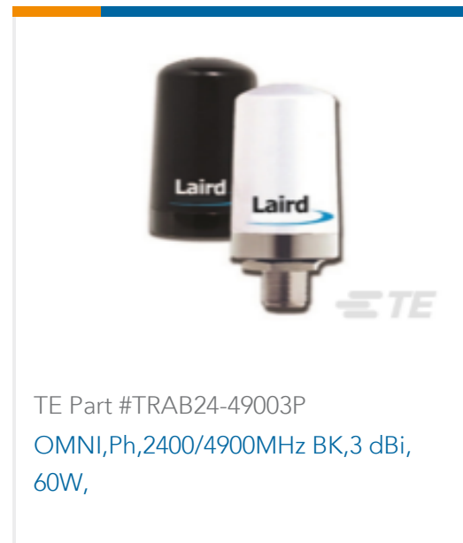
TE Part #TRAB24-49003P OMNI,Ph,2400/4900MHz BK,3 dBi, 60W,