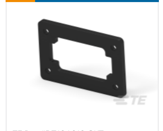
TE Part #DT12-L012-GKT GASKET DT 12 WY FLD RC