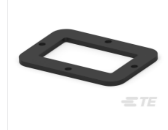
TE Part #DRC24-GKT GASKET, 24P, BLK, DRC16