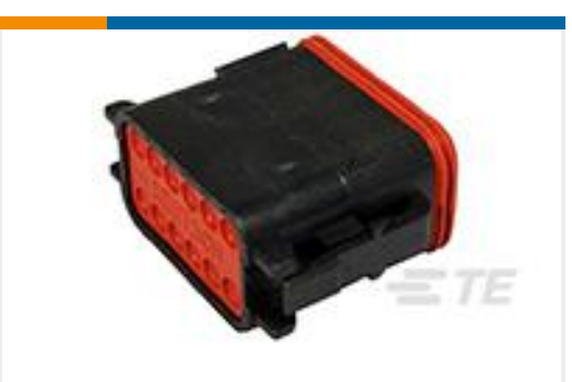
TE Part #DT06-12SB PLG, 12P, BLK, N, B