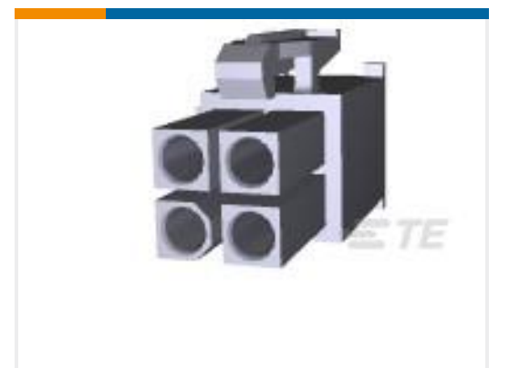
TE Part #172338-1 MINI UMNL PLUG HOUSING 4P