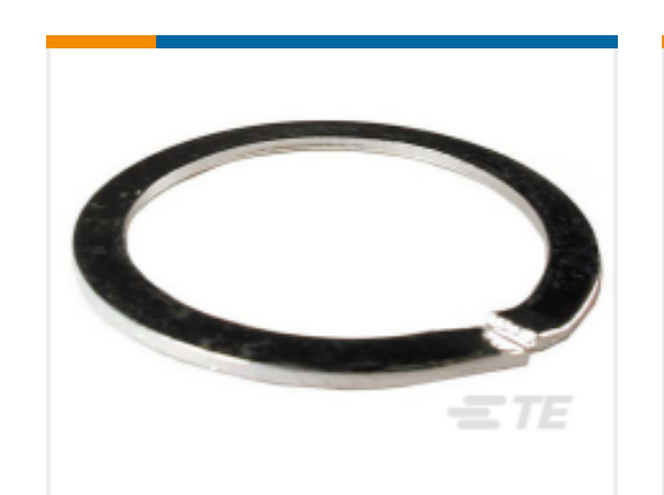
TE Part #114021-ZZ LOCKWASHER, SIZE 18, HD30