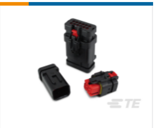
TE Part #776428-1 AMPSEAL 16 Housings