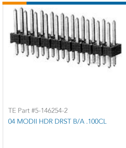
TE Part #5-146254-2 04 MODII HDR DRST B/A .100CL