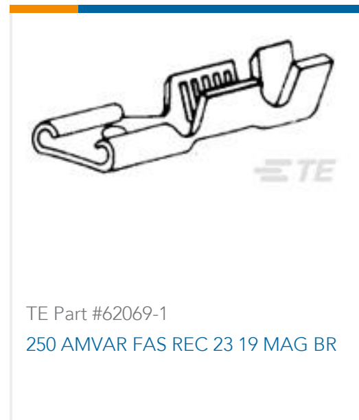
TE Part #62069-1 250 AMVAR FAS REC 23 19 MAG BR