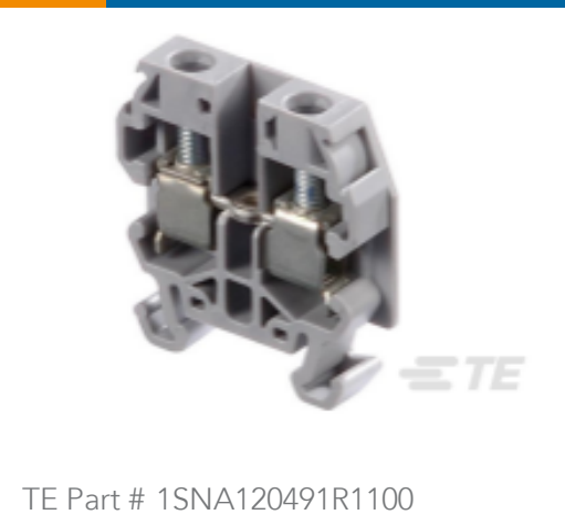
TE Part # CH5299-000 PP000010