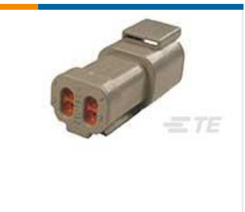
TE Part # DTM04-4P-E003 REC, 4P, GRY, N, CAP