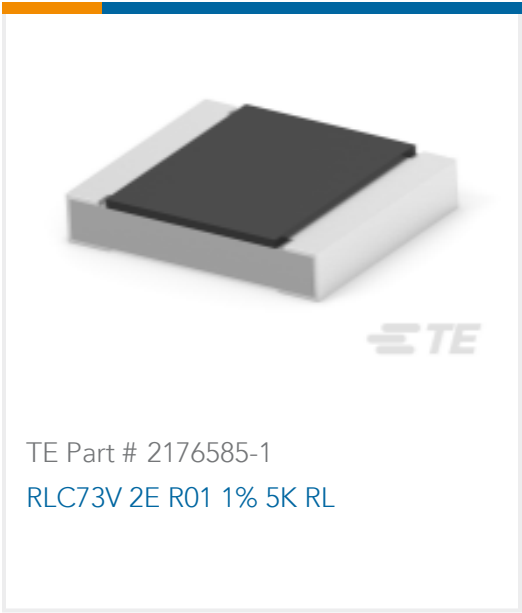
TE Part # 2176585-1 RLC73V 2E R01 1% 5K RL