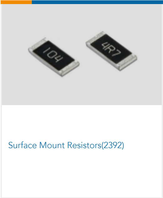
Surface Mount Resistors(2392)