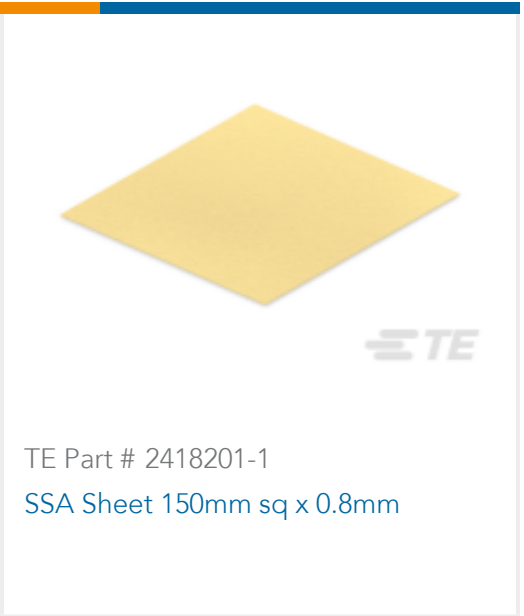
TE Part # 2418201-1 SSA Sheet 150mm sq x 0.8mm