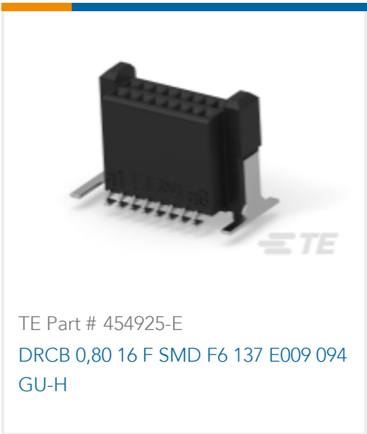
TE Part # 454925-E DRCB 0,80 16 F SMD F6 137 E009 094 GU-H