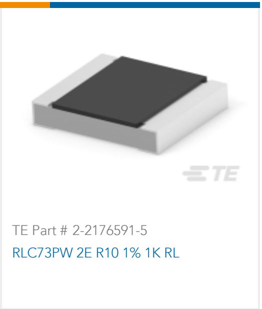
TE Part # 2-2176591-5 RLC73PW 2E R10 1% 1K RL