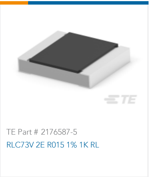
TE Part # 2176587-5 RLC73V 2E R015 1% 1K RL