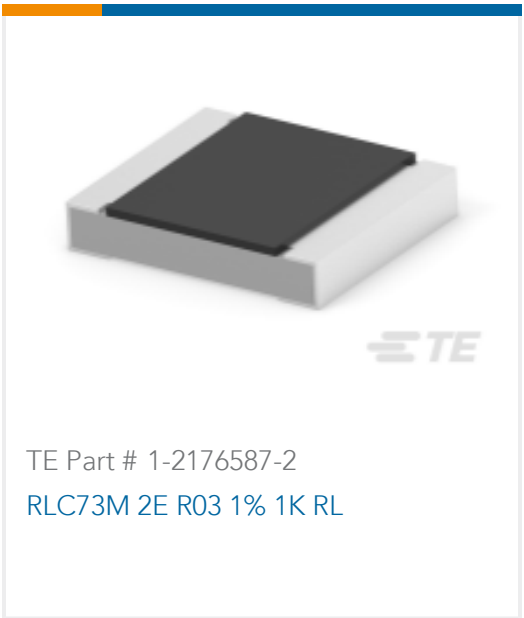
TE Part # 1-2176587-2 RLC73M 2E R03 1% 1K RL