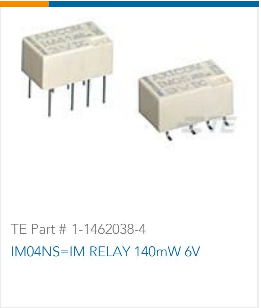
TE Part # 1-1462038-4 IM04NS=IM RELAY 140mW 6V