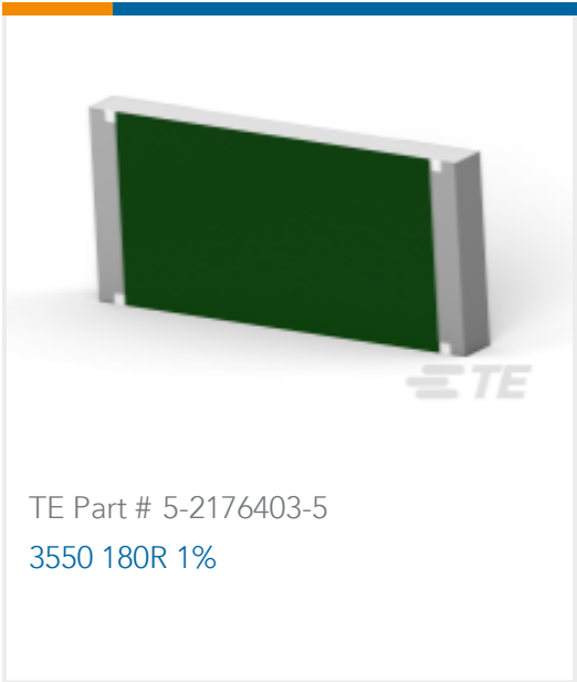
TE Part # 5-2176403-5 3550 180R 1%