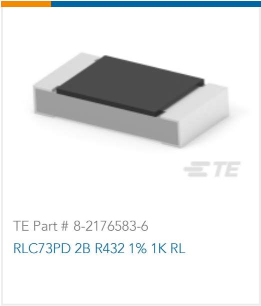
TE Part # 8-2176583-6 RLC73PD 2B R432 1% 1K RL