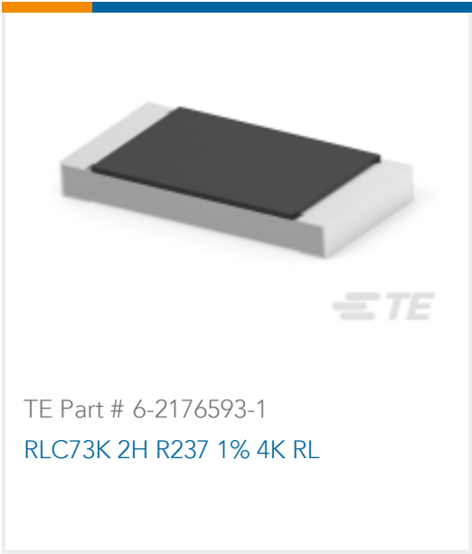
TE Part # 6-2176593-1 RLC73K 2H R237 1% 4K RL