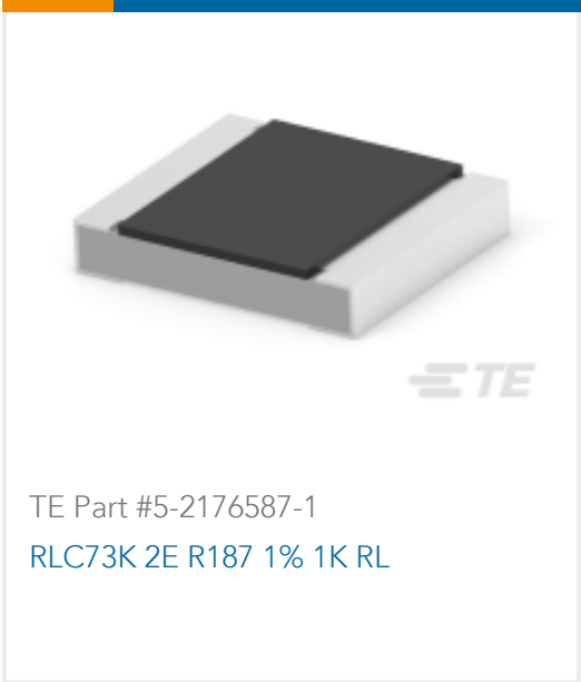
TE Part #5-2176587-1 RLC73K 2E R187 1% 1K RL