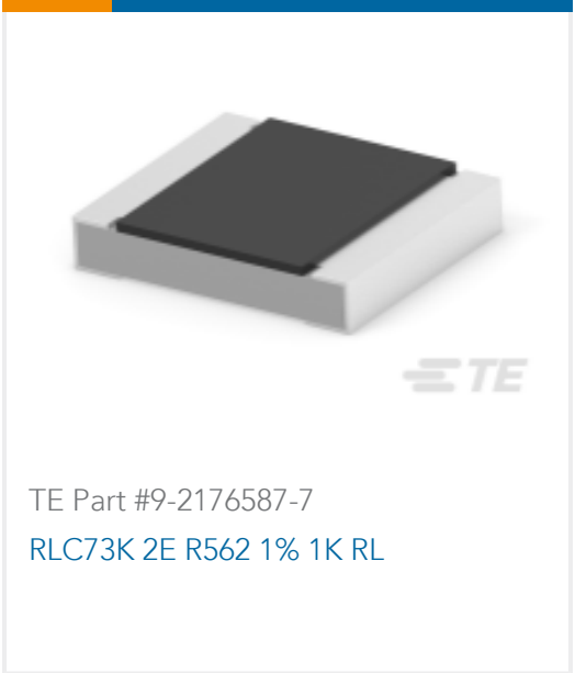
TE Part #9-2176587-7 RLC73K 2E R562 1% 1K RL