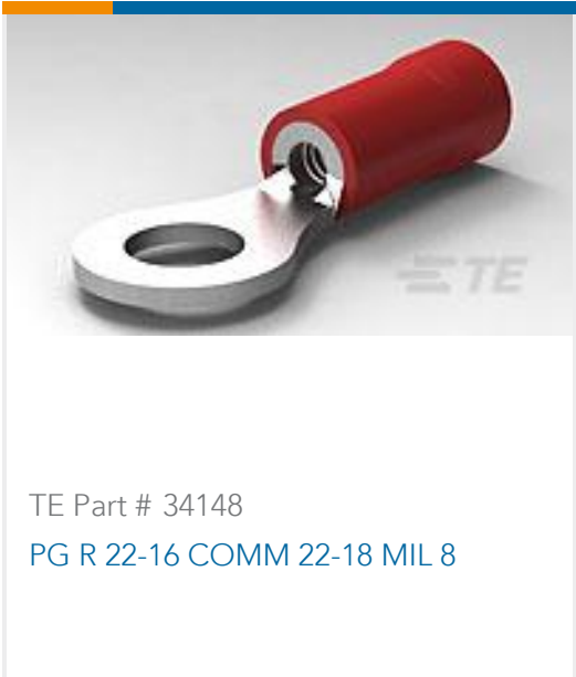
TE Part # 34148 PG R 22-16 COMM 22-18 MIL 8