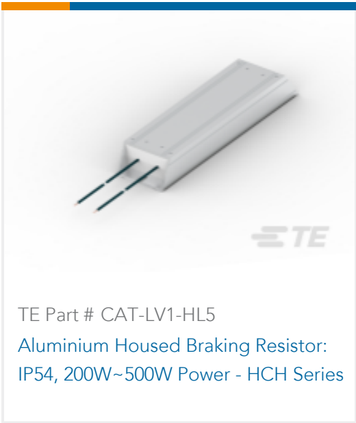
TE Part # CAT-LV1-HL5 Aluminium Housed Braking Resistor: IP54, 200W~500W Power - HCH Series