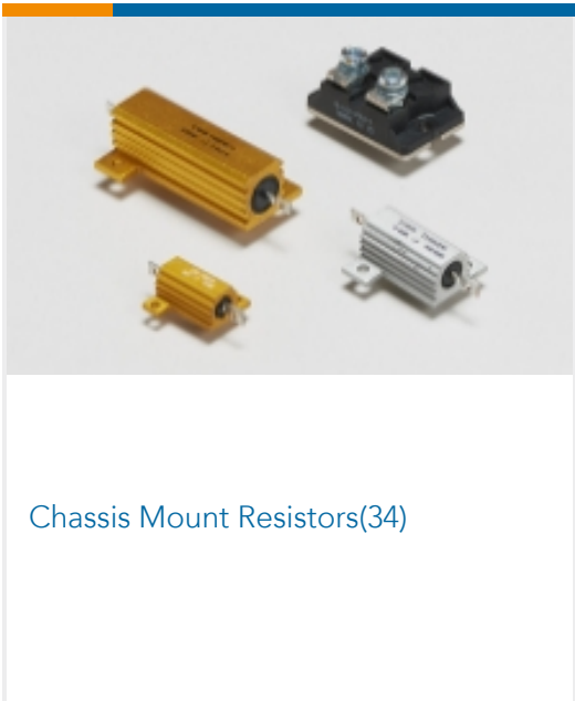
Chassis Mount Resistors(34)