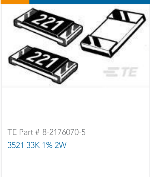
TE Part # 8-2176070-5 3521 33K 1% 2W