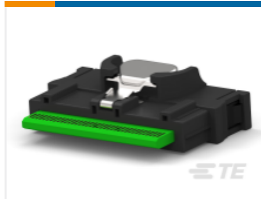
TE Part #2317823-1 CABLE PLUG KIT, SLIVER 74P