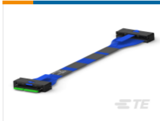
TE Part #2324305-1 C/A, SLIVER 124P, STR TO STR