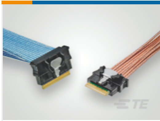
TE Part #2821385-1 SLIVER C/A, 74P, R/A TO R/A, 10GHZ, 85OHM