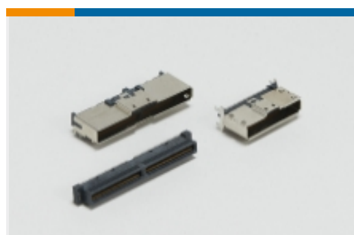
Internal I/O Connectors(133)