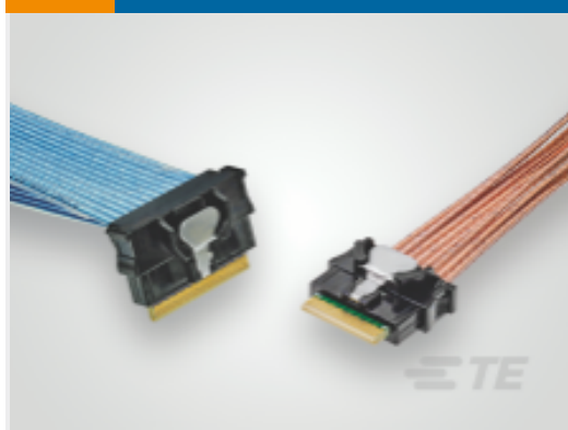
TE Part # 2821385-1 SLIVER C/A, 74P, R/A TO R/A, 10GHZ, 85OHM