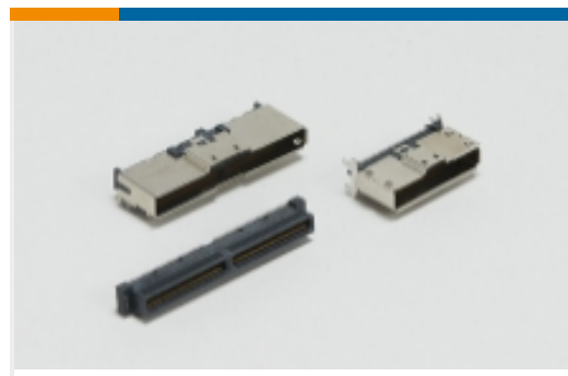
Internal I/O Connectors(133)