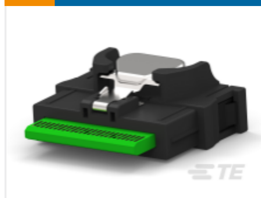
TE Part # 2317815-1 CABLE PLUG KIT, SLIVER 50P,