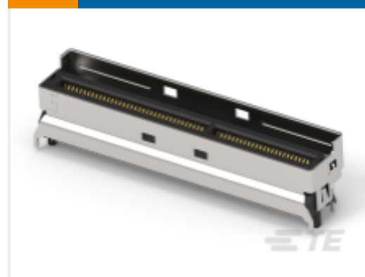
TE Part # 1-2381578-6 MCIO INTERGRATED CONN, V/T, 124P SMT TYPE