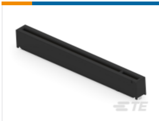
TE Part # 6-2371900-8 PCIE G5 CONN,164P,ASSY,30",SLIM, NO RIDGE