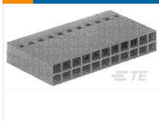
TE Part # 104482-3 08 SHORT PT RCPT HSG DR .100CL