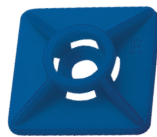
PA 6.6 DT

** Please consider a suitable safety factor equal or above 2