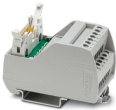
VARIOFACE interface module, with LED, for 8 channels

https://www.phoenixcontact.com/us/products/2322249