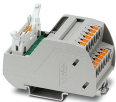
VARIOFACE interface module, with push-in connection and light indicator, for 8 channels

https://www.phoenixcontact.com/us/products/2904279