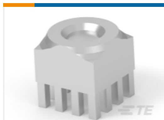
TE Part # 225689-E POWELM BUCHSE RUNDM M5 6 2,54 * EP 6 CUS