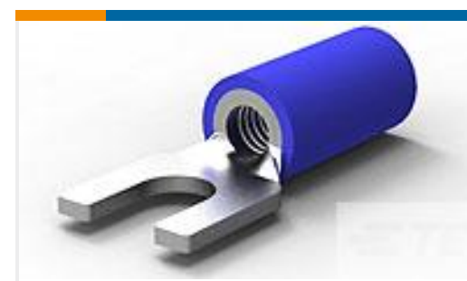
TE Part # 322994 TERMINAL,PG SPD 16-14 6