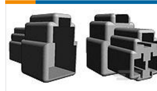
TE Part # 1-172131-1 FF 250 CAP HSG 3P NYLON NAT