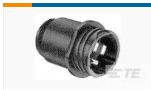
TE Part # 206137-2 23-7 FREE HANGING RECEPT