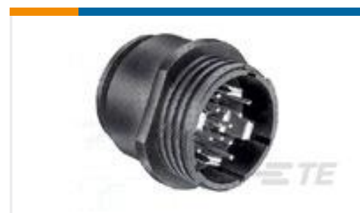
TE Part # 207486-2 RECEPT,SZ 23-16,CPC