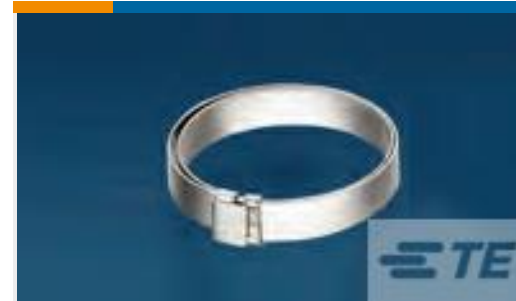
TE Part # CW2823-000 R85049/128-3