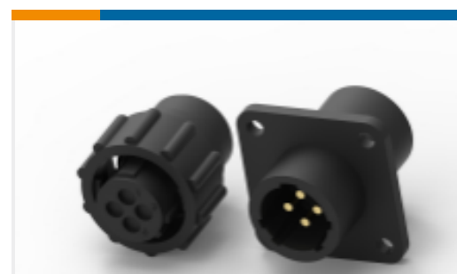
TE Part # 213848-1 Cable/Panel Mount Connector, CPC Series 1