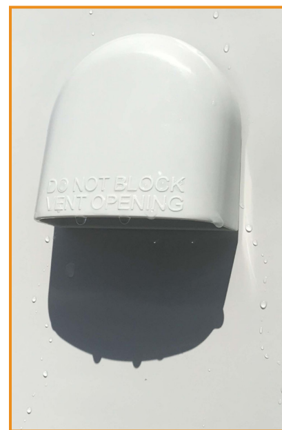
AttaBox Breather Vent Kit installed on a polycarbonate enclosure.