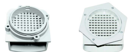
REAH-V60 (60MM), REAH-V80 (80MM)