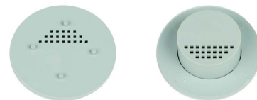
REDV1PVC OR REDVK3KIT