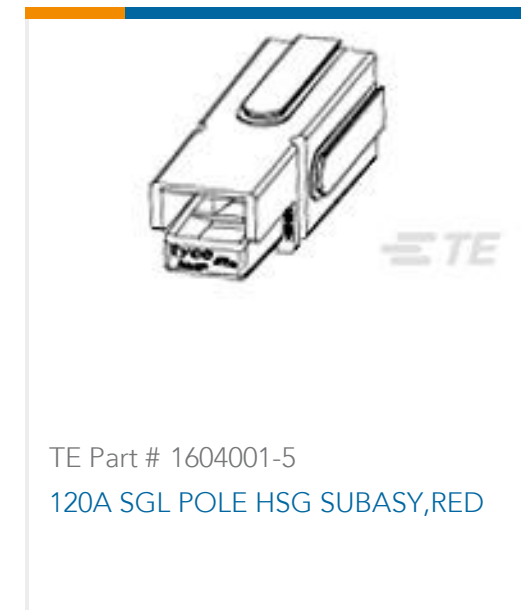
TE Part # 1604001-5 120A SGL POLE HSG SUBASY, RED