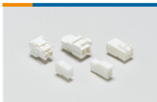
Rectangular Power Connectors(9)