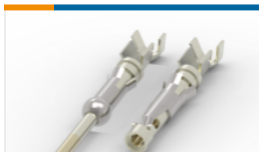
TE Part # 1-66359-4 Strip Pin and Socket Contacts, Type III