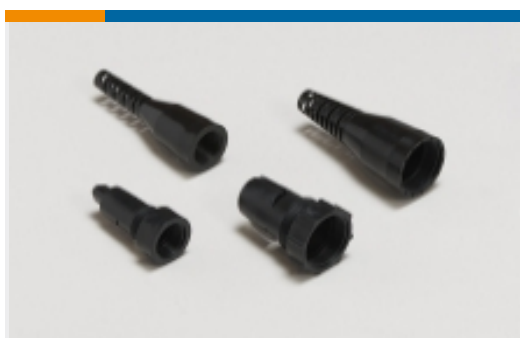
Connector Strain Relief(1)