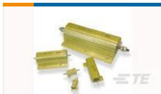
TE Part # 2-1630024-1 HSC250 R47 5%