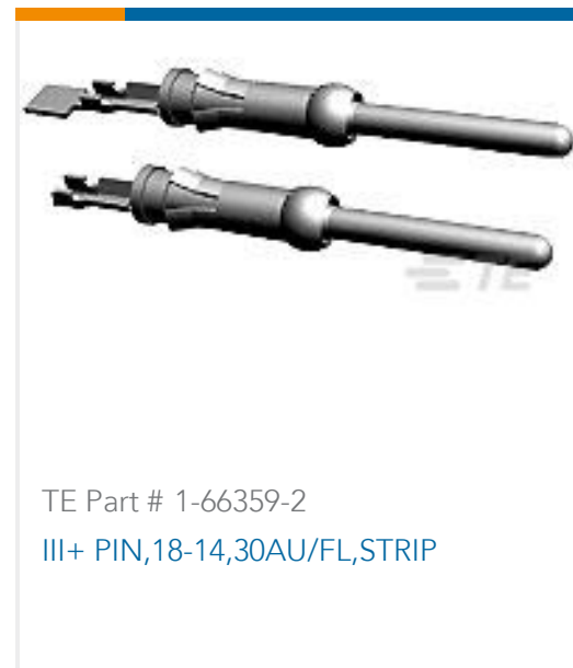
TE Part # 1-66359-2 III+ PIN, 18-14, 30AU/FL, STRIP