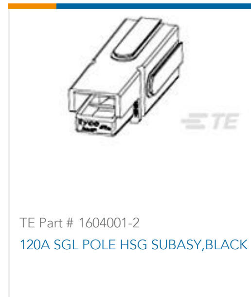
TE Part # 1604001-2 120A SGL POLE HSG SUBASY, BLACK