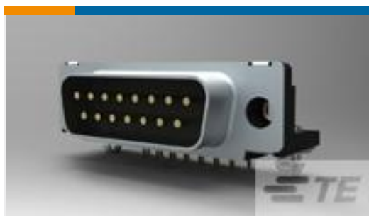
TE Part # 5747841-3 15 MSFL PLUG RA 318 (IN,FM,BL)