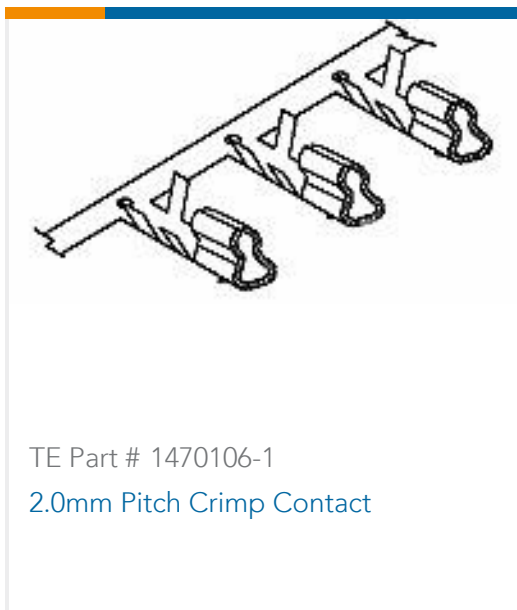
TE Part # 1470106-1 2.0mm Pitch Crimp Contact