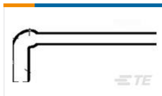
TE Part #391373-000 222A213-4/42-0