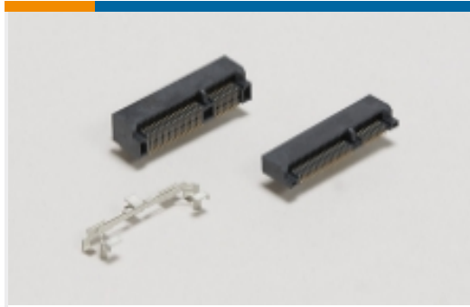
Mini PCI Express & mSATA(1)