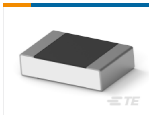
TE Part #7-2176381-1 RC 0805 66K5 0.1% 10PPM 5K RL