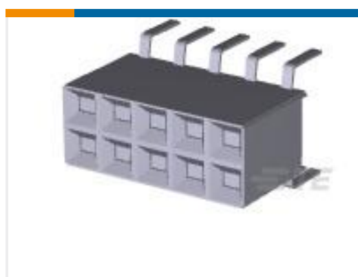
TE Part #534267-3 10 MODIV VRT DR OE 100/125