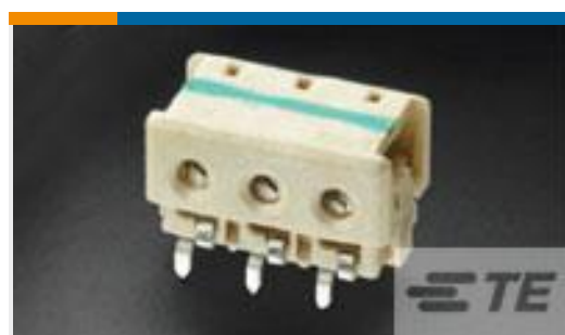
TE Part #2106751-1 Connector, Thru Hole-IDC, 1 pos, 18AWG