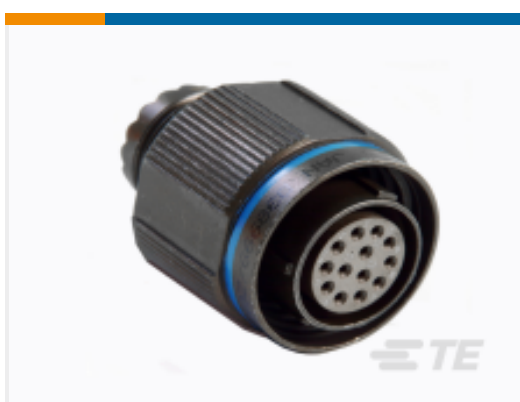
TE Part #YDTS26F13-35SNC001 PLUG ASSY