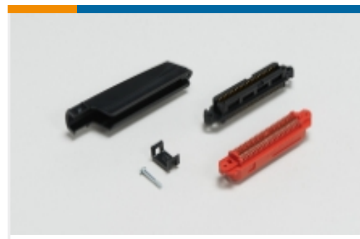
IDC D-Sub Connectors(1)