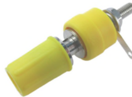
CL1557 - TP2 YELLOW UNASSEMBLED

Current Rating: 15A. Flammability: Min UL94HB