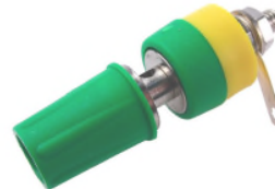
CL1553 - TP2 GREEN UNASSEMBLED CL1573 - TP2 GREEN ASSEMBLED