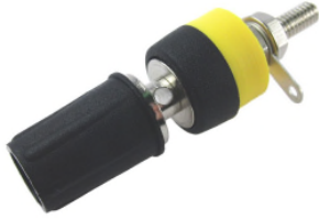
CL1550 - TP2 BLACK UNASSEMBLED CL1575 - TP2 BLACK ASSEMBLED