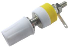
CL1554 - TP2 WHITE UNASSEMBLED