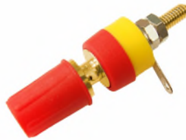
CL15511 - TP2 RED GOLD UNASSEMBLED CL15511A - TP2 RED GOLD ASSEMBLED