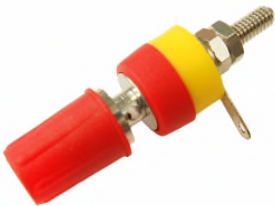
CL1551 - TP2 RED UNASSEMBLED CL1572 - TP2 RED ASSEMBLED