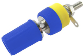
CL1552 - TP2 BLUE UNASSEMBLED