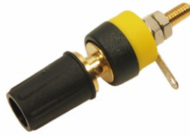
CL15501 - TP2 BLACK GOLD UNASSEMBLED CL15501A - TP2 BLACK GOLD ASSEMBLED