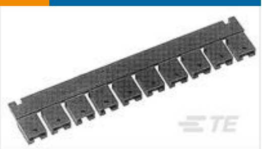
TE Part #382811-8 SHUNT, ECON, PHBR 5AU, BLACK