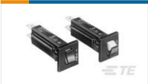
TE Part #6-1393250-3 W28-XT1A-10=W28