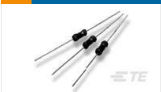
TE Part #2-1879353-5 RR02 5% 43K AMMO