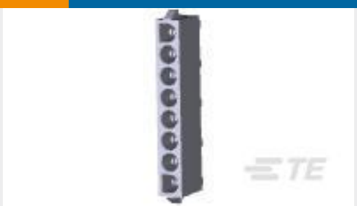
TE Part #643410-1 08P UMNL PIN HDR ASSY POL 94VO