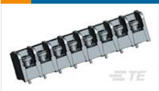
TE Part #2-1437658-1 8PCV-08-006=#8 TRIBARRIER