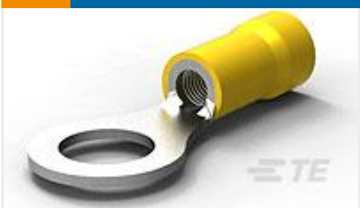
TE Part #34856 TERMINAL,PG R 12-10 5/16