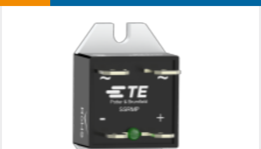
TE Part #2323802-3 SSRMP-240D10 = Mini Puck,10A,240V AC