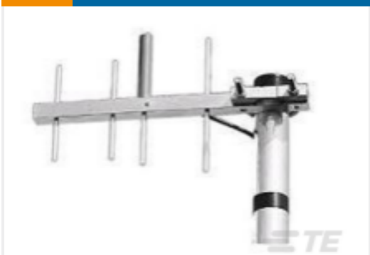
TE Part #PC904N Yagi,FWA,12in,NF 896-980MHz,6dBd