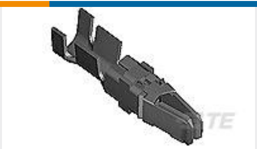
TE Part #1-66740-9 TYPE XII FEMALE CONT (STRIP)