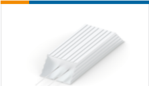
TE Part #2176507-4 CJP 200W 1R0 5% Lead