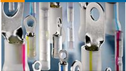
TE Part #696422-5 PIDG PVF2 R 22-16COM22-18MIL 8