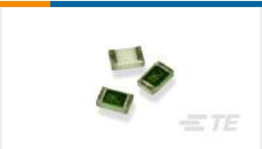
TE Part #2-1614885-7 CPF 0805 910K 0.1% 25PPM 1K RL