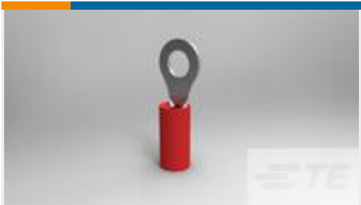
TE Part #171508-5 PIDG RING UL.CSA(22-16)