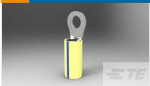
TE Part #53057 TERMINAL, PIDG, R, IR, 24, #10