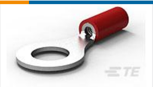
TE Part #342105-1 TERM, RT, PLASTI-GRIP, 22-16, M6[1/4]