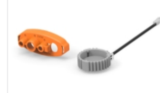
Connector Caps & Covers(19)