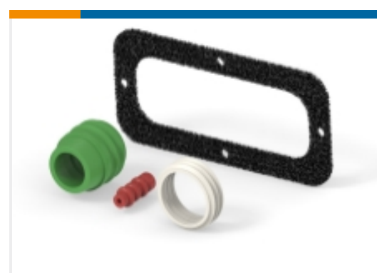
Connector Seals & Cavity Plugs(36)