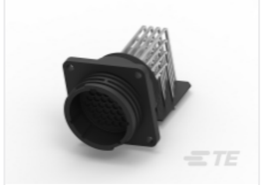
TE Part # CAT-AM71-C83998F Connectors with Posted Pin Contacts, CPC Series 1