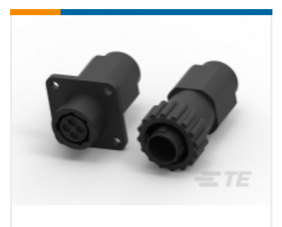
TE Part # CAT-AM71-C83998Y One-Piece Connector, Sealed, CPC Series 1

TE Part # 206975-1 CABLE CLAMP BODY SIZE 13