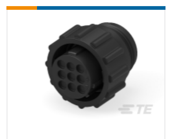
TE Part # 206708-1 CPC PLUG ASSEMBLY SIZE 13-9