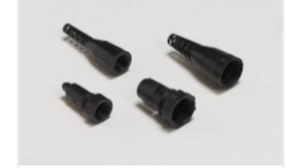
Connector Strain Relief(60)