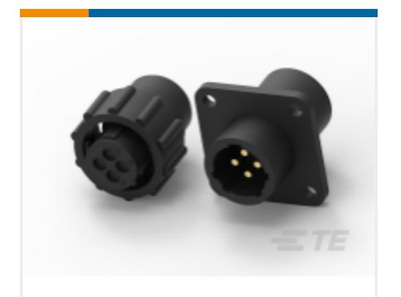
TE Part # CAT-AM71-C83998J Cable/Panel Mount Connector, CPC Series 1