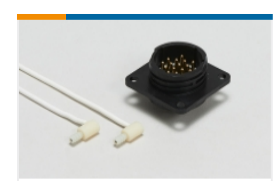
Circular Power Connectors(458)