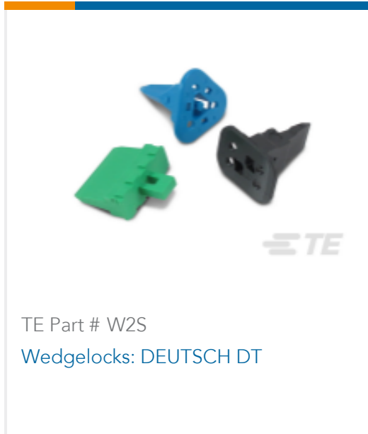
TE Part # W2S Wedgelocks: DEUTSCH DT