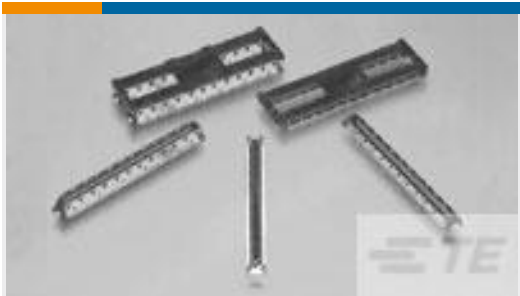
TE Part #3-1827253-6 .5FHP05H,220,S,GIG,08/Sn,HT,NSYes