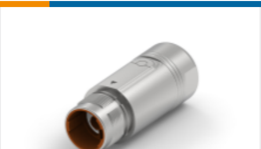
TE Part #BKA199N00420100000 923 EXTENSION, SPEEDTEC