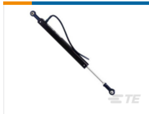
TE Part # CLP-150 LINEAR POT, IP65, 150MM RANGE