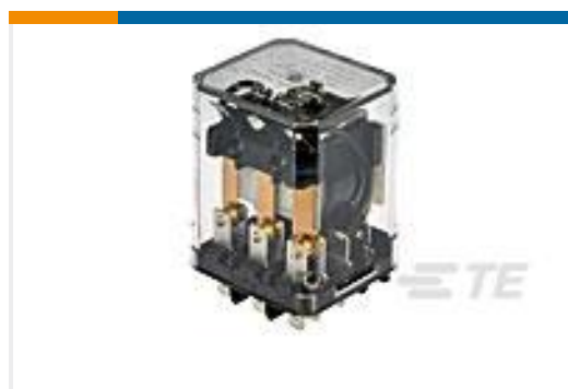
TE Part # 1-1393118-4 KUP-14D15-24=KU-