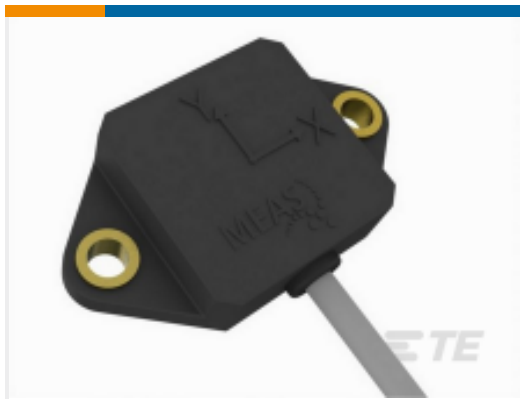
TE Part # G-NSDOG2-002 AXISENSE-2 V-OUT-45 TILT SENSOR FLOOR MT