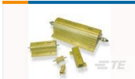
TE Part # 3-1625999-2 HSC100 3R0 5%