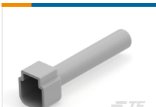
TE Part # DTM4S-BT BOOT, 4P, PLG, ST, GRY