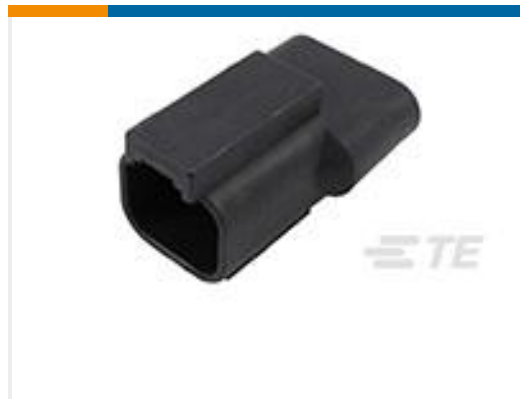
TE Part # DT04-2P-RT01 REC, 2P, BLK, 600V, 1.28V, 4A DIODE, NI