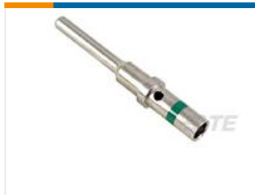
TE Part # 0460-215-16141 PIN, SOLID, SIZE 16, 14AWG, NI