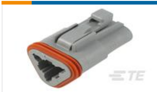
TE Part # DT06-3S PLG, 3P, GRY, N