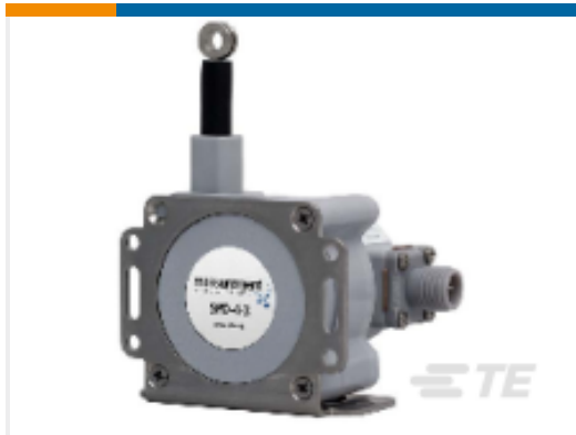
TE Part # SPD-50-3 STRING POT 50 INCH RANGE