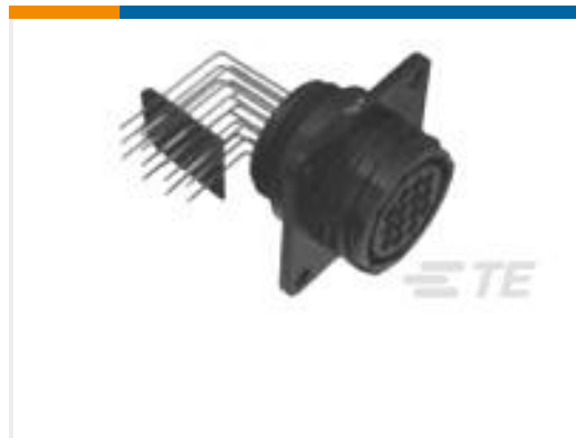
TE Part # 796500-2 CPC POSTED RCPT,13-7,R/A