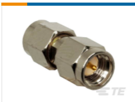
TE Part # ADP-SMAM-SMAM SMA Plug to SMA Plug