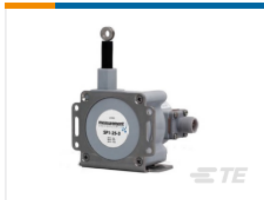
TE Part # SP1-50-3 STRING POT 50 INCH RANGE