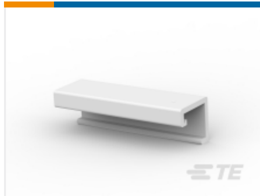
TE Part # 640550-6 Polyester PCB Connector Covers: 2.54 mm, MTA 100