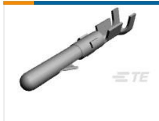
TE Part # 60620-1 CMNL PIN 20-14 TPBR L/P