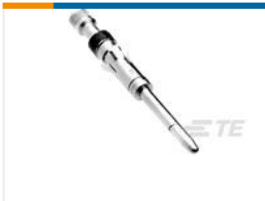
TE Part # 204219-1 PIN CONTACT ASSY.