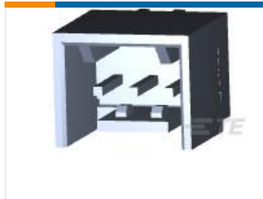
TE Part # 2-644861-3 03P MTA100 SHRD HDR,W/O PEG SN