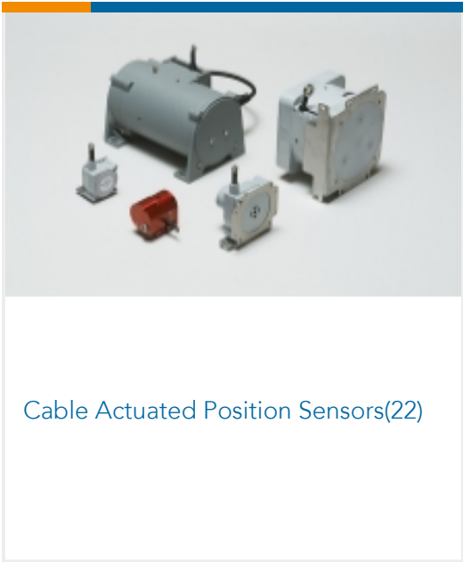
Cable Actuated Position Sensors(22)