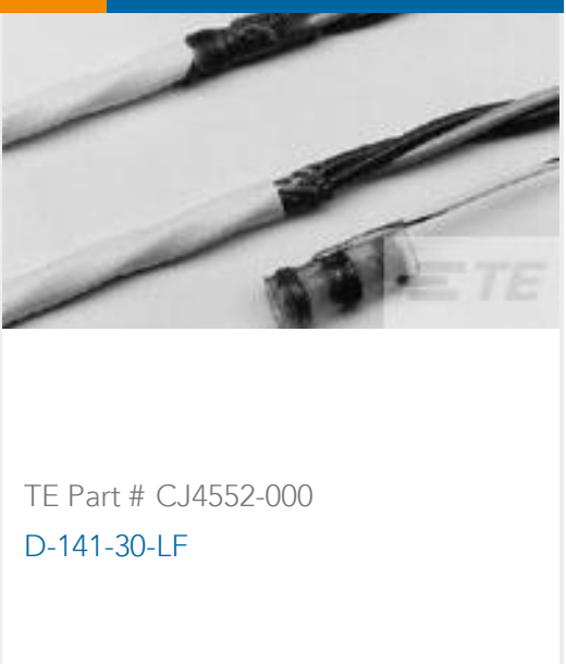
TE Part # CJ4552-000 D-141-30-LF