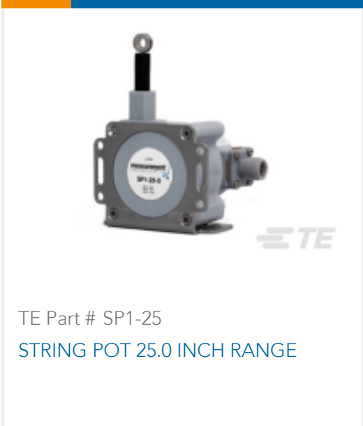
TE Part # SP1-25 STRING POT 25.0 INCH RANGE