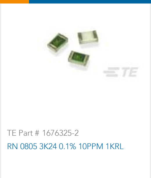
TE Part # 1676325-2 RN 0805 3K24 0.1% 10PPM 1KRL