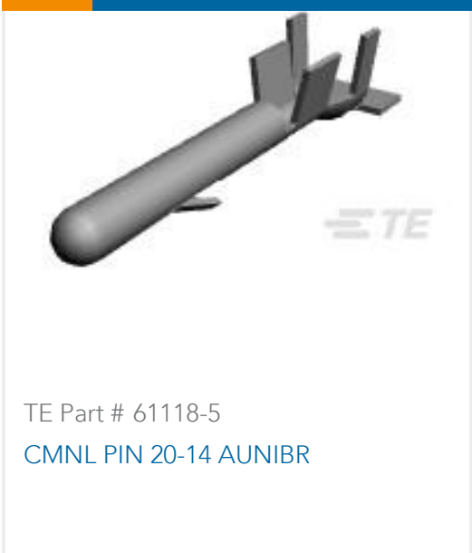
TE Part # 61118-5 CMNL PIN 20-14 AUNIBR