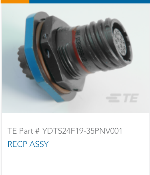
TE Part # YDTS24F19-35PNV001 RECP ASSY