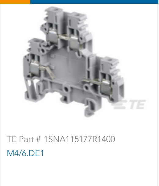
TE Part # 1SNA115177R1400 M4/6.DE1