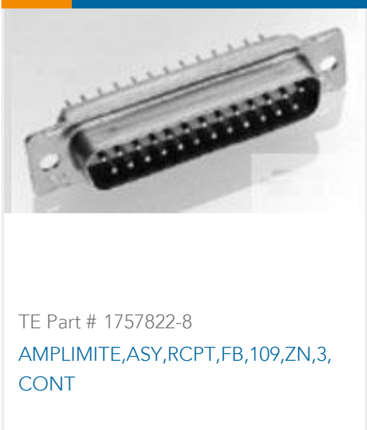
TE Part # 1757822-8 AMPLIMITE,ASY,RCPT,FB,109,ZN,3,CONT