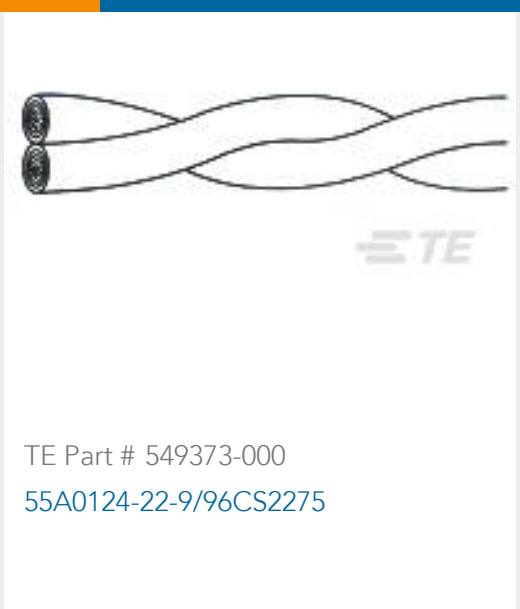
TE Part # 549373-000 55A0124-22-9/96CS2275