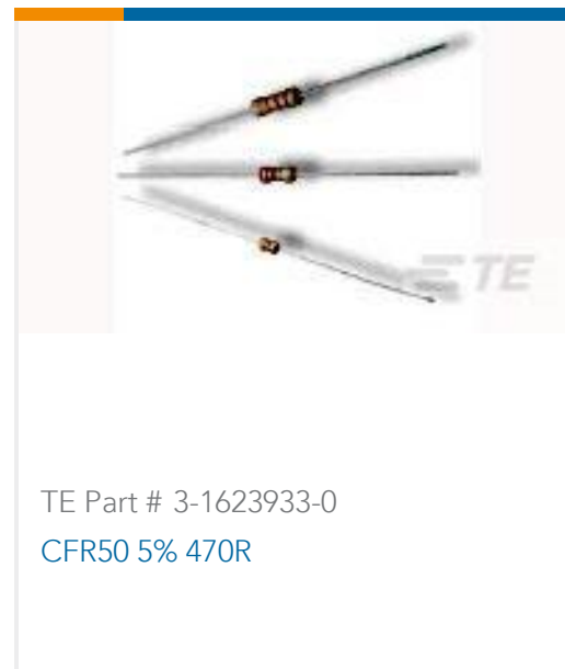
TE Part # 3-1623933-0 CFR50 5% 470R