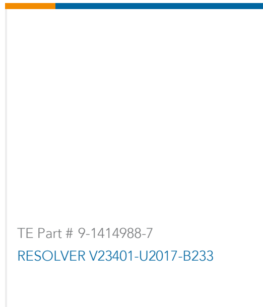
TE Part # 9-1414988-7 RESOLVER V23401-U2017-B233