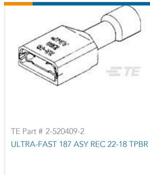
TE Part # 2-520409-2 ULTRA-FAST 187 ASY REC 22-18 TPBR