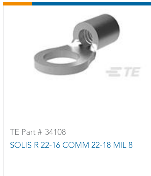
TE Part # 34108 SOLIS R 22-16 COMM 22-18 MIL 8