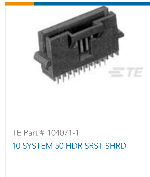
TE Part # 104071-1 10 SYSTEM 50 HDR SRST SHRD