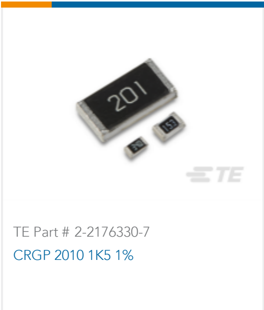
TE Part # 2-2176330-7 CRGP 2010 1K5 1%