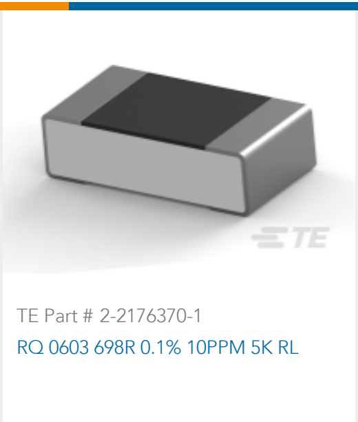
TE Part # 2-2176370-1 RQ 0603 698R 0.1% 10PPM 5K RL