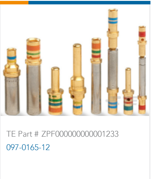
TE Part # ZPF000000000001233 097-0165-12