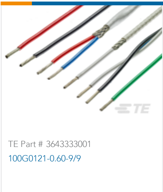
TE Part # 3643333001 100G0121-0.60-9/9