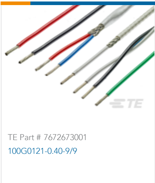
TE Part # 7672673001 100G0121-0.40-9/9