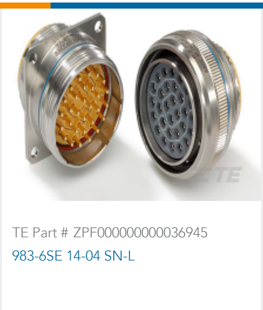
TE Part # ZPF0000000000036945 983-6SE 14-04 SN-L