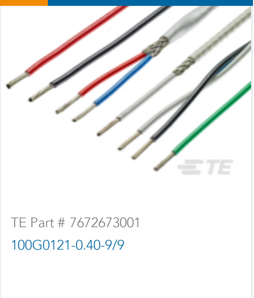
TE Part # 7672673001 100G0121-0.40-9/9