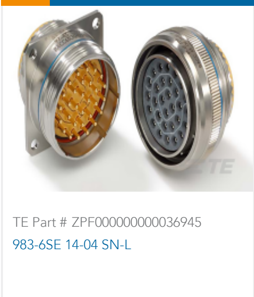
TE Part # ZPF0000000000036945 983-6SE 14-04 SN-L