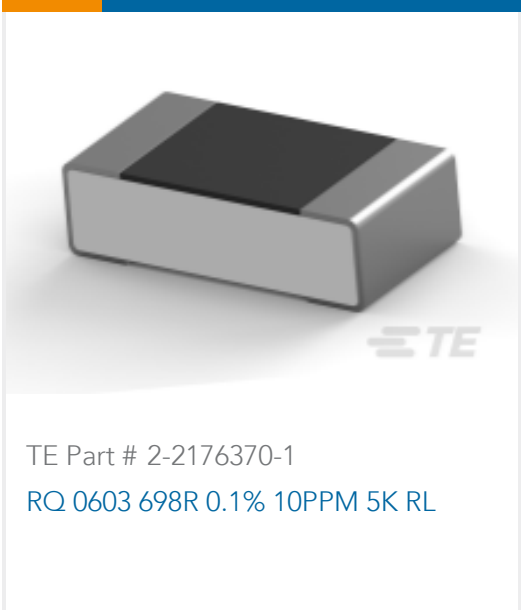
TE Part # 2-2176370-1 RQ 0603 698R 0.1% 10PPM 5K RL