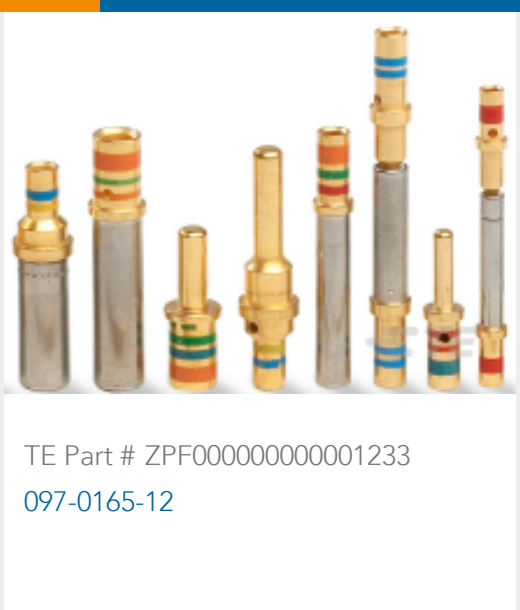
TE Part # ZPF000000000001233 097-0165-12