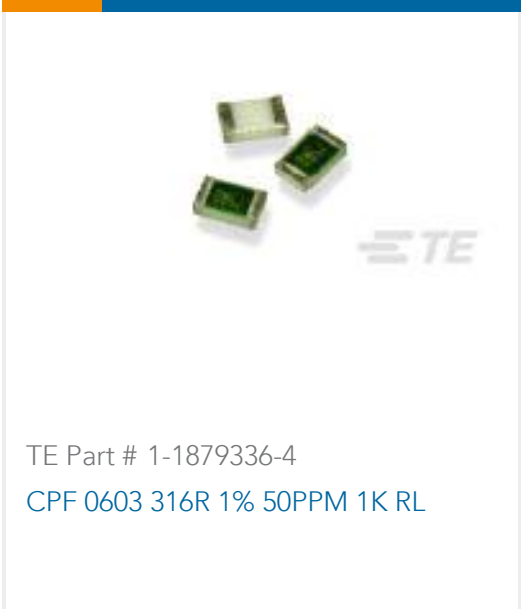
TE Part # 1-1879336-4 CPF 0603 316R 1% 50PPM 1K RL