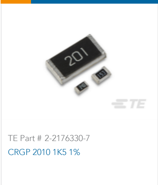
TE Part # 2-2176330-7 CRGP 2010 1K5 1%