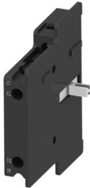
Auxiliary switch block, for 3TB52...3TB56, 3TC52, 3TC56, left