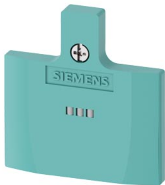
LED cover for position switch for plastic enclosure 50 mm LEDs, yellow/green, 24 V DC Color yellow