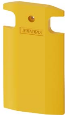
Cover yellow for position switch metal XL, 56 mm wide