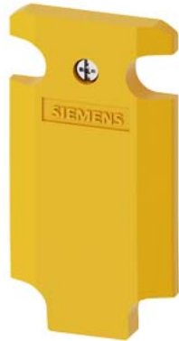
Cover yellow for position switch Plastic 3SE513 Enclosure according to EN N50041