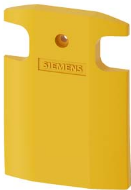
Cover yellow for position switch metal 3SE51, Enclosure 56 mm wide