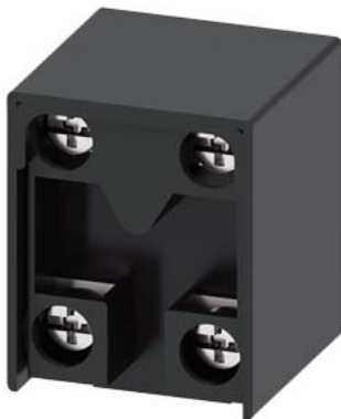
Contact block for position switch 3SE51/52 1 NO/1 NC slow-action contact