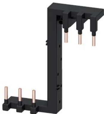
Safety main power connector for series connection of two contactors 3RT202. Size S0 screw terminal