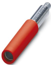
Test plug strip, number of positions: 1, color: red

Please be informed that the data shown in this PDF document is generated from our online catalog. Please find the complete data in the user documentation. Our general terms of use for downloads are valid.