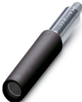
Test plug strip, number of positions: 1, color: black

Please be informed that the data shown in this PDF document is generated from our online catalog. Please find the complete data in the user documentation. Our general terms of use for downloads are valid.