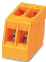
Transformer terminal block, connection method: Screw connection, length: 28.5 mm, width: 15 mm, height: 19 mm, color: orange

Please be informed that the data shown in this PDF document is generated from our online catalog. Please find the complete data in the user documentation. Our general terms of use for downloads are valid.