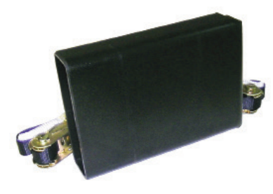
24-04 Hydraulic Pruner Holder Includes handle holder unit 8.25"H x 11.75"W x 2.6"D