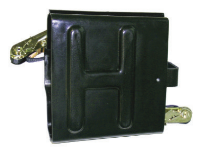
24-02 Circular Saw Holder Includes Handle Holder Unit 11.5"H x 11.75"W x 6.5"D

Offering out-of-bucket storage for tools, these heavy duty tool holders mount on the boom. Water repellent and UV resistant, they are designed to withstand extreme weather conditions.