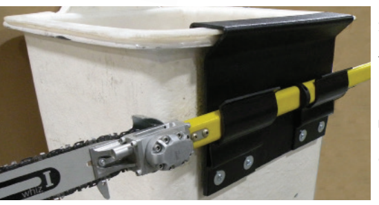
24-23 Long Reach Chainsaw Holder For Telescoping Boom Trucks or Spider Lifts

Holds round- and oval-handled long reach hydraulic chainsaws and gas powered pole pruners (standard and telescoping). 14"H x 18"W x 4"D