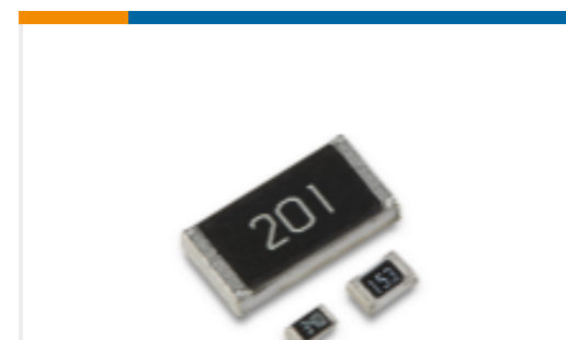
TE Part # 1-2176326-3 CRGP 0603 100R 1%