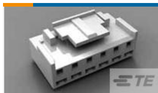
TE Part # 1-1123722-6 3.96 EP PLUG HSG 6P(NATURAL)