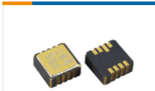
TE Part # 3038-0500 Model 3038 SMT DC Accelerometers