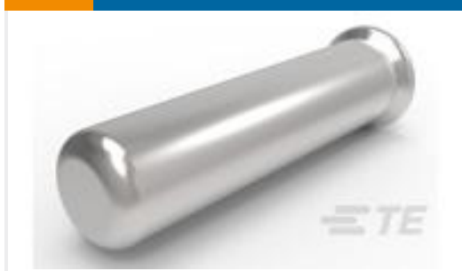
TE Part # 5050864-1 SOCKET,MIN-SPR SN-AU SER-3