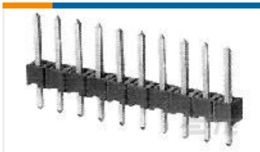
TE Part # 826629-2 2P AMPMODU II