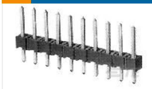
TE Part # 826629-5 AMPMODU II HEADER