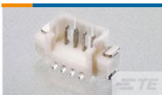
TE Part # 1734260-4 1.25 WTB HDR SMT, 4 POS