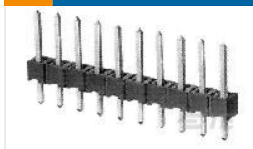
TE Part # 826629-3 3P AMPMODU II