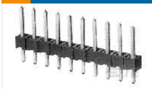
TE Part # 1-826629-0 10P AMPMODU II STIFT LEI