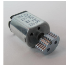
ERM Eccentric Rotating Mass Motor

Linear vibration motors are an excellent choice for haptic feedback applications requiring a device with high reliability and exceptionally long life. Compared to traditional ERM vibration motors, LRA's are a superior choice for haptic applications due to their faster rise / fall times. Vibration energy is generated by an internal mass that oscillates back and forth along one axis at its resonant frequency.