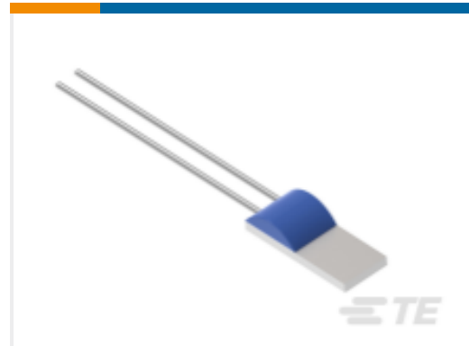
TE Part # NB-PTCO-168 Pt1000, 2.0x5.0, Class A, PTFD102A1G0