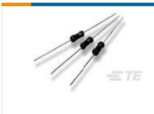
TE Part # 6-1879352-4 RR02 5% 130R AMMO