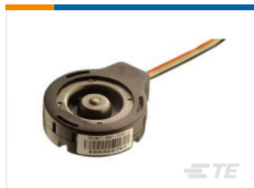
TE Part # FX1901-0001-0200-L 200 LBF COMPRESSION LOAD CELL 100MV