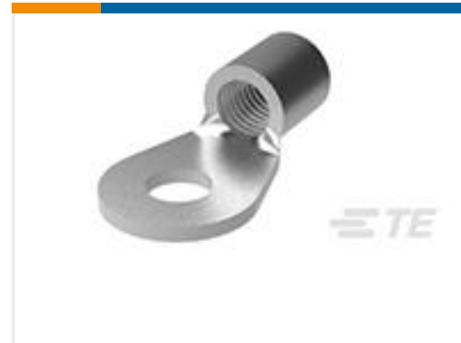
TE Part # 130552 TERM, RING, SOLIS, 6, M5