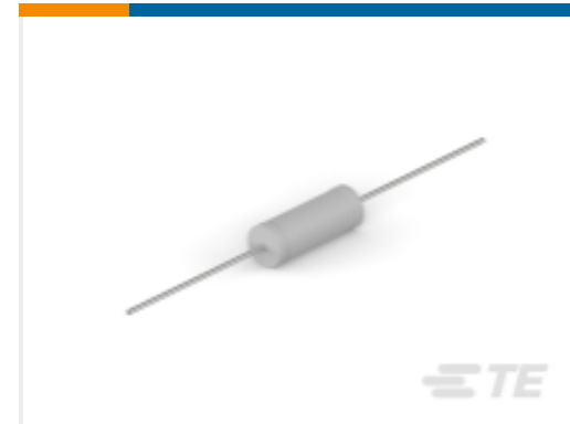
TE Part # 4-2176412-3 5W XSM M/OX 5% 300R