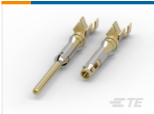
TE Part # 163092-2 Pin and Socket Contacts, Type III, LP EMEA